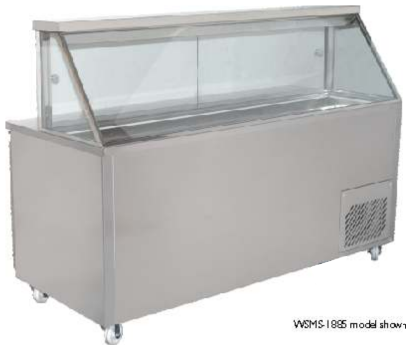
WSMS-1885 model shown