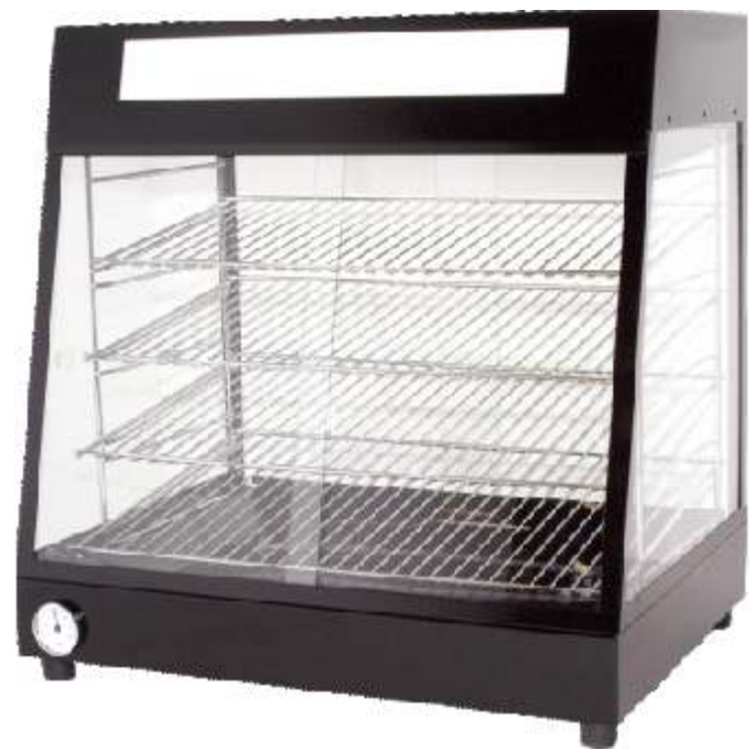
Model shown WPIM60