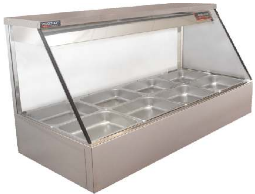
Model shown WHFS23

WHFS/C26 - 6 x ½ pans wide, 2 rows Kw 3.6 W 2005 D 600 H 690