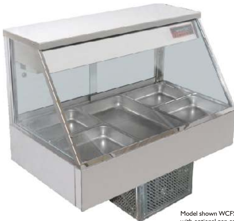
Model shown WCFS23 with optional pan combination