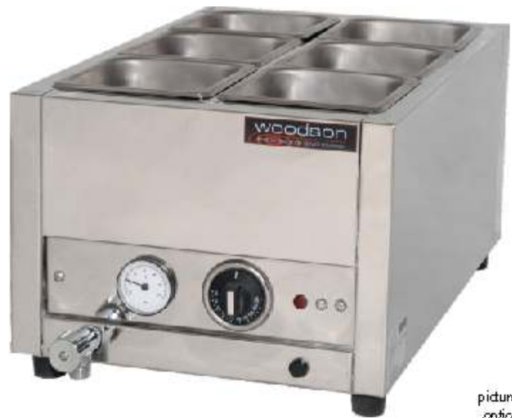
pictured with optional pan combination