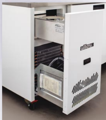
Removable cassette simplifies cleaning