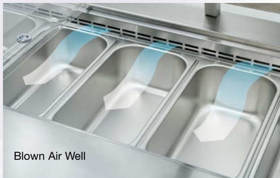
Blown Air Well