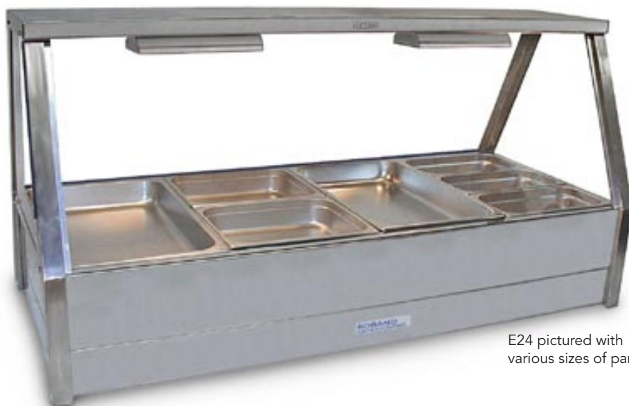
E24 pictured with various sizes of pans

These Double Row Hot Food Display Bars have streamlined styling that will enhance food presentation whilst keeping the food at the correct serving temperature. A wide range of sizes and options are available to cater for numerous combinations of Gastronorm pans.