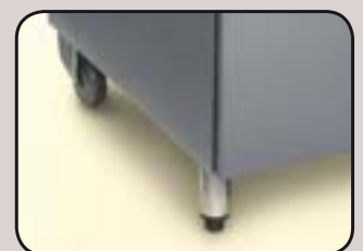
Rear castors and adjustable front legs for complete manoeuvrability.