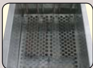
Fishplate, element cover and cool zone below elements to prolong your oil life.