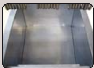
Open tank provides clear access for easy cleaning.