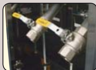
Wide 25 mm (1") diameter drain pipe with lockable ball valve.