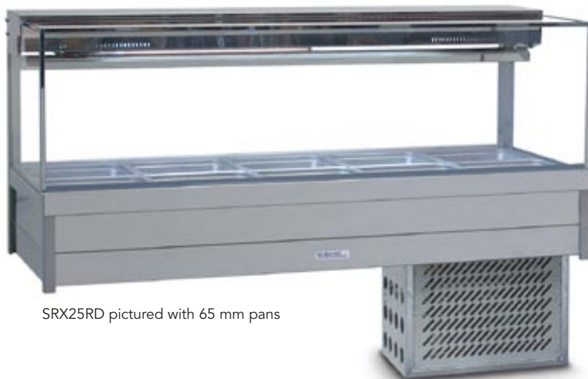
SRX25RD pictured with 65 mm pans