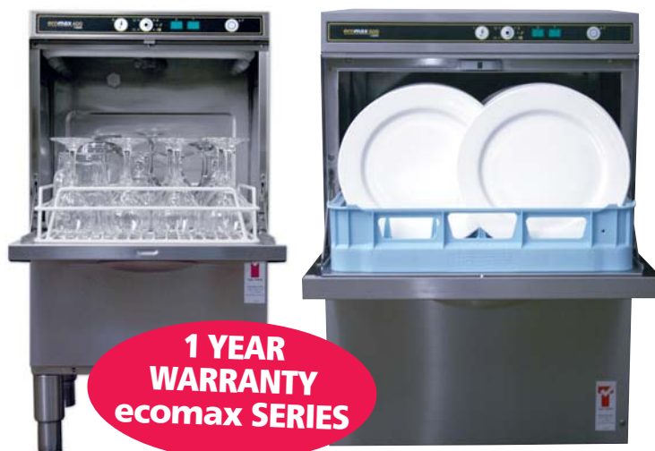
ecomax 400-17 & ecomax 500