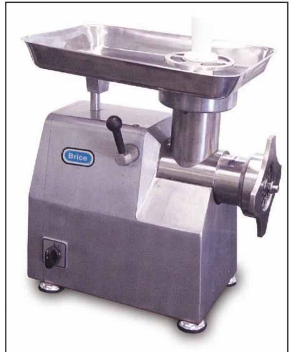
The powerful mid-range TJ22 works hard in larger butcher shops and restaurants.