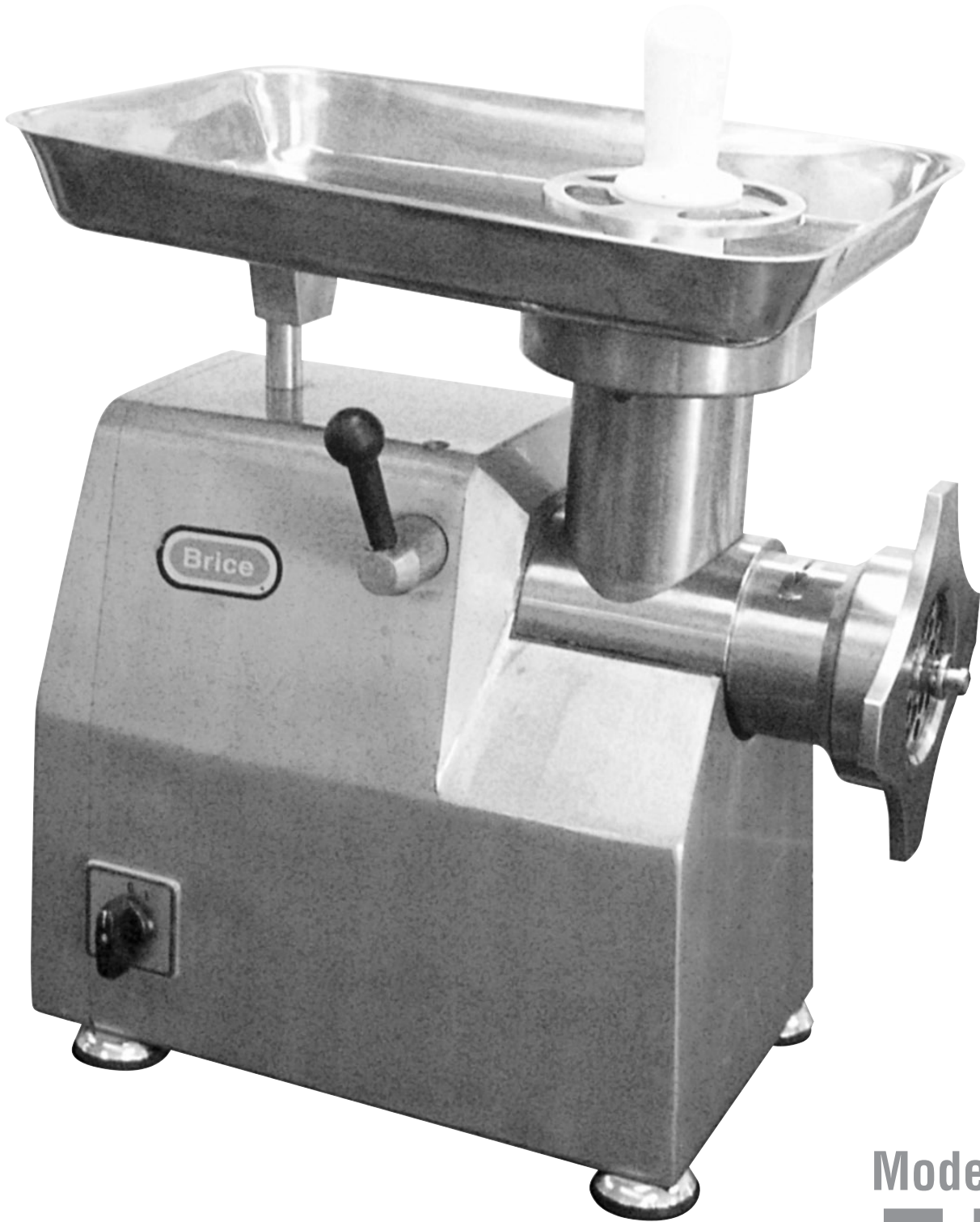
Model TJ Meat Mincers