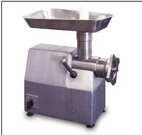
The TJ32 is the powerhouse of the range, with a throughput of up to 320kg per hour